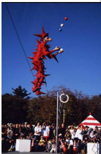
Shizuoka Street Performers' World Cup