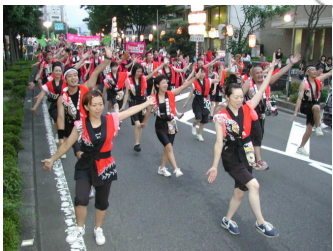
Shimizu Port Festival (Minato Kappore Dance)